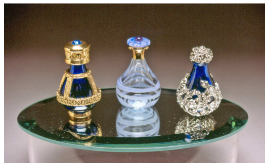
Pictured: Gold-banded Roma, Amethyst Contemporary & Silver Victorian Tear Bottles atop an Oval Mirror Riser (Item# 6829)

Did you know . . . 30 million people in the U.S. today are in some phase of the grieving process? Let us help you serve this important market need with our exclusive, unique and made in the USA products.