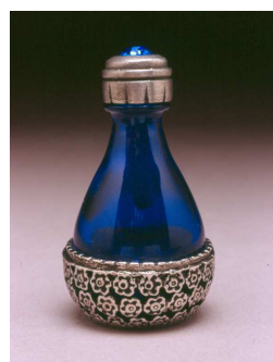
SILVER BASKET DISCONTINUED 2012