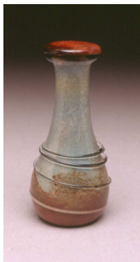
VERDIGRIS ITEM# 4054

The Contemporary line features a high-end selection of individually, hand-made tear bottles. Splashes or swirls of colored glass decorate the bases. Hand-painted 24K gold luster adorns the neck of most bottles. We have commissioned just 500 Commemorative Tear Bottles (#4030), to honor those whose lives were affected by the tragic events of September 11 and those who serve in the military.