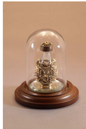
Gold Angel on small mirror inside Short Mini-dome Item# 3026/#7024/#6874