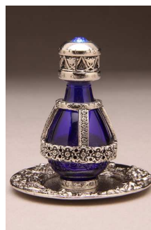
SILVER-BANDED ITEM# 1008

Made in the U.S.A. with Lead-Free Metals.