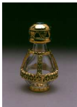
GOLD-BANDED ITEM# 1015