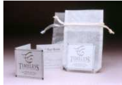
An organza gift bag & story card like those shown above come with each tear