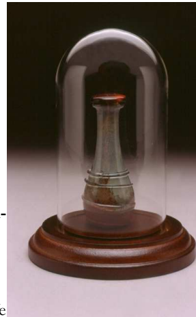
TALL MINI-DOME DISPLAY