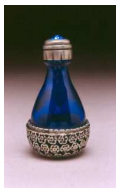
PEWTER BASKET ITEM# 1039