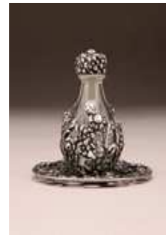
PEWTER ITEM# 2029

The intertwining T's of the Timeless Traditions logo appear in the filigree on the base of each bottle. As our least expensive line of tear bottles, these Victorian tear bottles are quite affordable for most gift-givers. Made in the U.S.A.