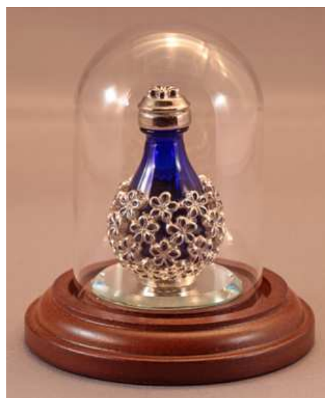
“Colored” Forget-Me-Not Tear Bottle™ Item#3057

← Optional Accessories: Mini-dome & mini-mirror