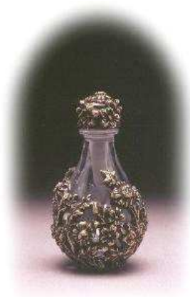
BRASS ITEM# 2005

A filigree design of flowers and leaves wrap around these petite cobalt or clear glass bottles. Timeless Traditions' tear bottles are approximately 2" high. Available in the five finishes shown below (brass, copper, pewter, gold or silver) with an optional petite matching display tray. A short mini-dome also beautifully displays these bottles and keeps them dust and touch free.