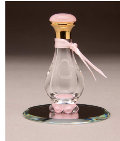
Item# 4085 Pink Ribbon Tear Bottle & Gift Card

Above is our hand-blown "Pink Ribbon Tear Bottle". Created to symbolize hope, encouragement and support for those battling breast cancer, this tear bottle comes with a Pink Ribbon Gift Enclosure Card, a tear bottle story card and an organza gift bag.