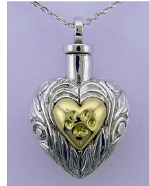
Paw Print Heart Ash Pendant