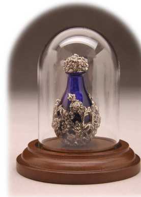
SILVER (ON BLUE GLASS) ITEM# 2043

The intertwining T's of the Timeless Traditions logo appear in the filigree on the base of each bottle. As our least expensive line of tear bottles, these Victorian tear bottles are quite affordable for most gift-givers. Made in the U.S.A.