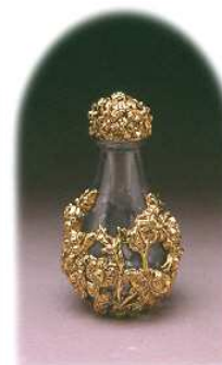
GOLD ITEM # 2036