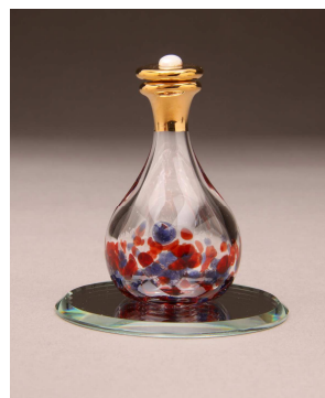
COMMEMORATIVE ITEM# 4030 LIMITED EDITION