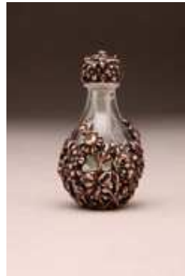
COPPER ITEM# 2012