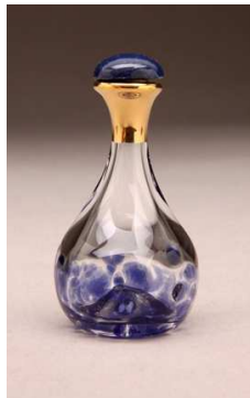
BLUE ITEM# 4009