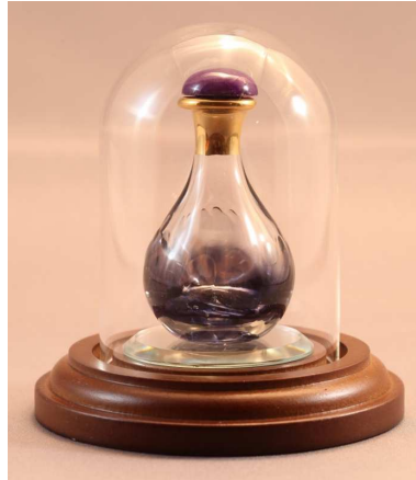
Violet Marble—Item# 4122

These hand-blown contemporary tear bottles are made by a glass artist in MT. They feature layers and swirls of colored glass and are perfect for concealing the keepsakes (tears, ashes, lock of hair, earth from a special place, or some other petite remembrance) inside. Shades of Blue with Navy stone cap on the upper left, and Olive with Tiger Eye stone cap below. Mourning Shades of violet & plum with a Purple Jade cap shown at bottom left.