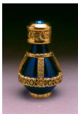
GOLD-BANDED ITEM# 1053

Our ROMA style tear bottles look beautiful with the petite Solid-Rim Metal Trays, like the Silver Solid-Rim Tray pictured below.