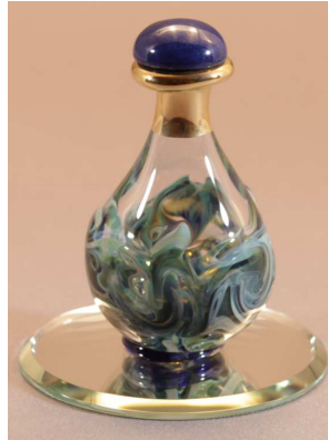
Blue Marble- Item#4108

These hand-blown contemporary tear bottles are made by a glass artist in MT. They feature layers and swirls of colored glass and are perfect for concealing the keepsakes (tears, ashes, lock of hair, earth from a special place, or some other petite remembrance) inside. Shades of Blue with Navy stone cap on the upper left, and Olive with Tiger Eye stone cap below. Mourning Shades of violet & plum with a Purple Jade cap shown at bottom left.