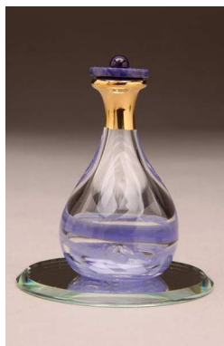
AMETHYST ITEM# 4047