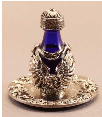
Blue/Silver Angel on silver tray Item# 3033/#6096

This tear bottle features the same design on opposite sides of the teardrop bottle. A serene face and a pair of grand upward sweeping angel wings on both sides with the wing-tips coming together near the top of the bottle. The cap compliments the design of the bottle with its intricate pattern. Perfect as a sympathy gift (with a Profound Loss card), or a gift of encouragement (with the Angel gift card.) See card text at right.