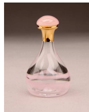
Baby Pink (Item# 4061)