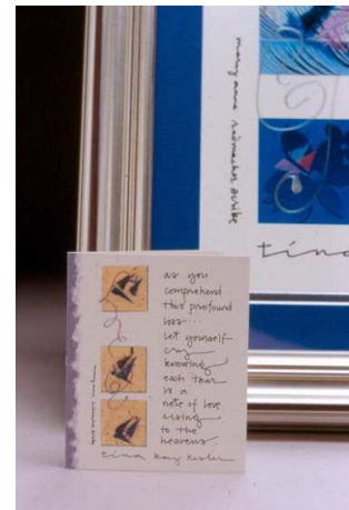
Profound Loss Enclosure Card

“As you comprehend this profound loss ... let yourself cry knowing each tear is a note of love rising to the heavens.” The print is a powerful focal point for a sympathy gift display. Timeless Traditions is the exclusive distributor of the print and card.