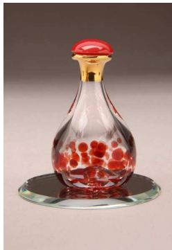
RED ITEM# 4023