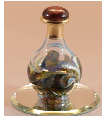
Olive Marble- Item#4115 Timeless Traditions, Inc.

Accented with a hand-carved cork to close the cap into the bottle and hand-painted with 24K gold luster on the rim, the swirls and layers of color are like the swirling glass in a child's marble, thus the name.