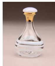
Baby Blue (Item# 4078)

Customers can also choose a "Tears of Joy" Gift card for new Babies on request.