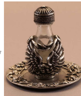
Pewter Angel on Pewter Sold Rim Tray Item# 3019/#6072

Optional Displays: Mirrors, Trays, Mini-domes are extra.