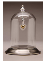
← 3"x4"H Mini-dome w/ Satin Pewter Base & Hook for displaying Keepsake Pendants